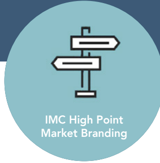
IMC High Point Market Branding